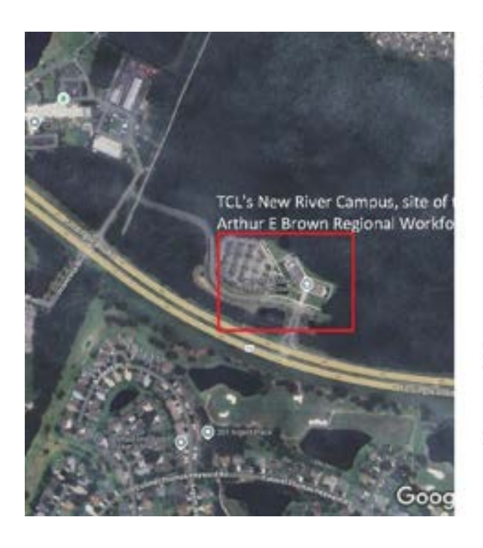
EXHIBIT A WORKFORCE CENTER SCOPE AND COSTS